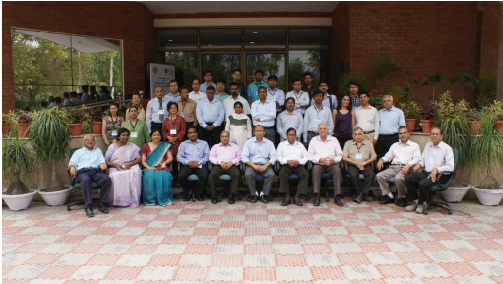
Faculty and participating delegates of “37th Workshop on Respiratory Allergy: Diagnosis & Management” held on 2th-6th April, 2012.